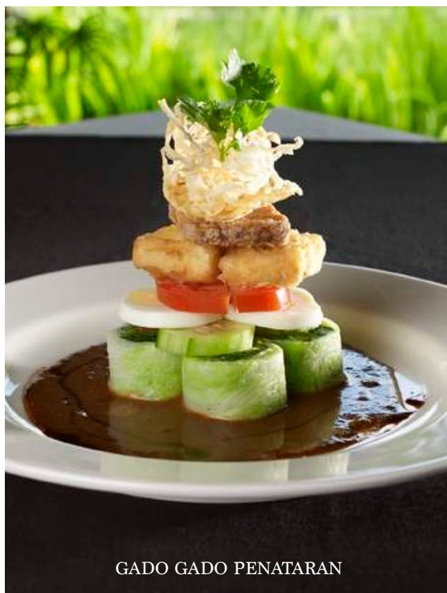
GADO GADO PENATARAN

Vegetarian fried rice with vegetable, crispy bean cake, proteina sate, fried tofu with red spicy and bean crackers.