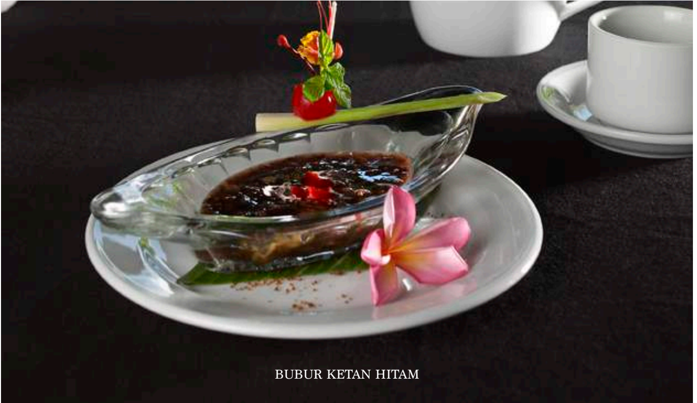
BUBUR KETAN HITAM