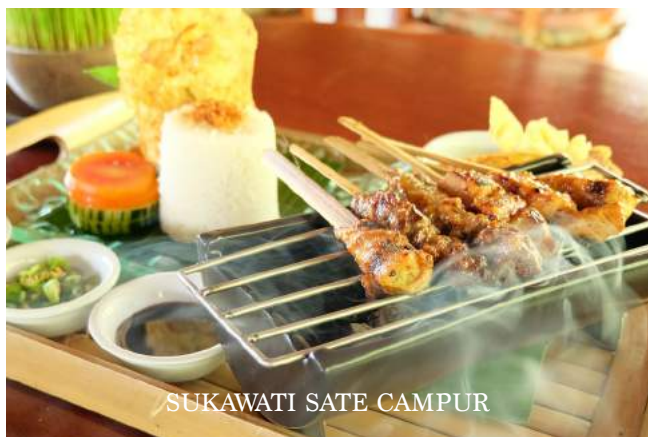
SUKAWATI SATE CAMPUR